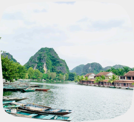
📍 Trang An - Ninh Binh, Vietnam